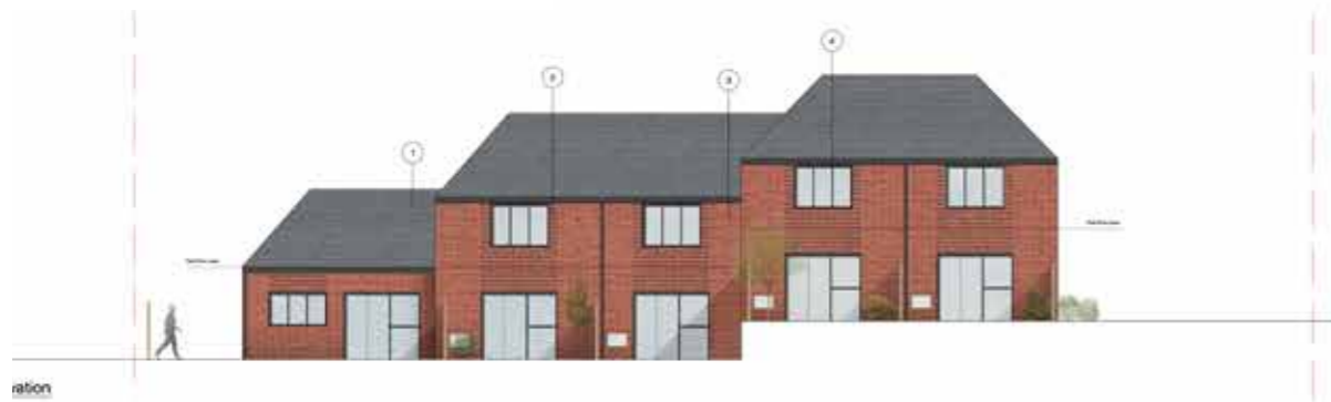
Rear, North facing elevations