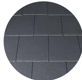
Grey roof tiles