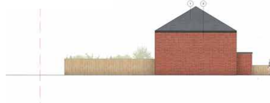
Side, West facing elevations