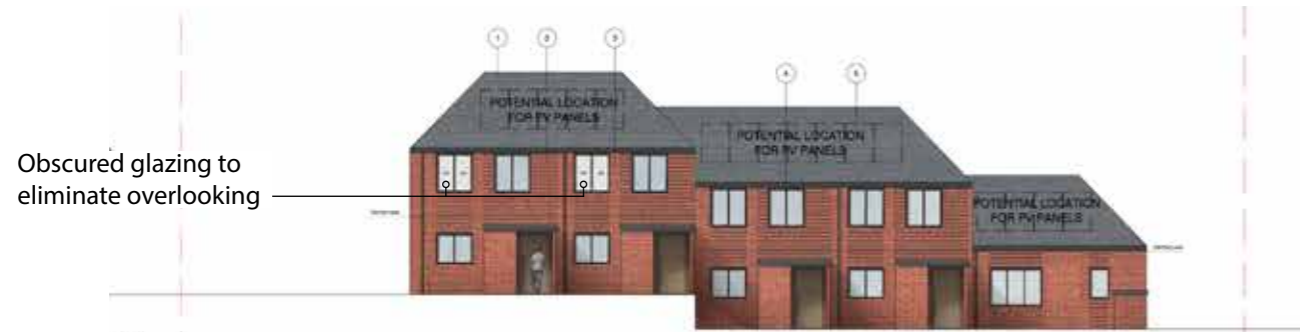
Front, South facing elevations