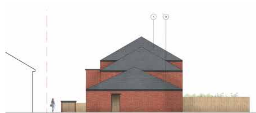
Side, East facing elevations