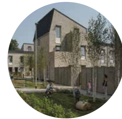
Examples of landscapes