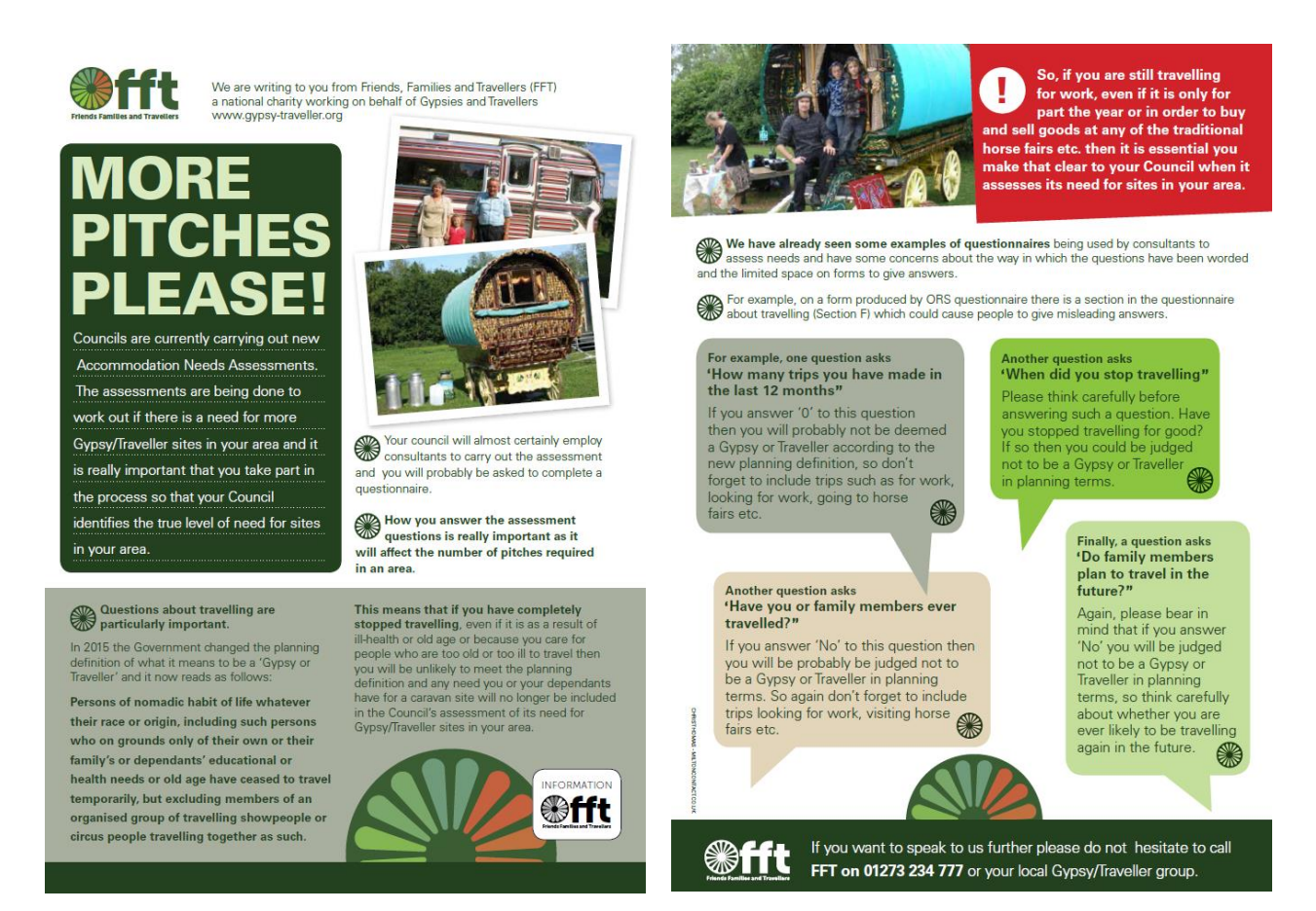
Figure 11 – Friends, Families and Traveller Leaflet