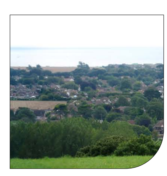
COMBINED SUMMARY April 2017