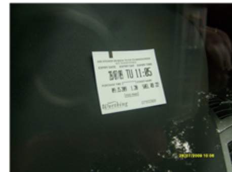
Click large image to view in new window