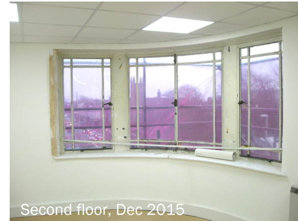
Second floor, Dec 2015