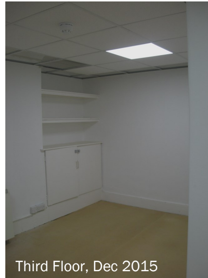
Third Floor, Dec 2015