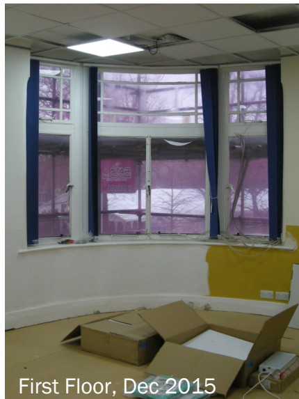
First Floor, Dec 2015