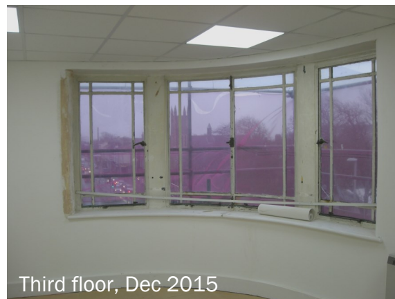
Third floor, Dec 2015