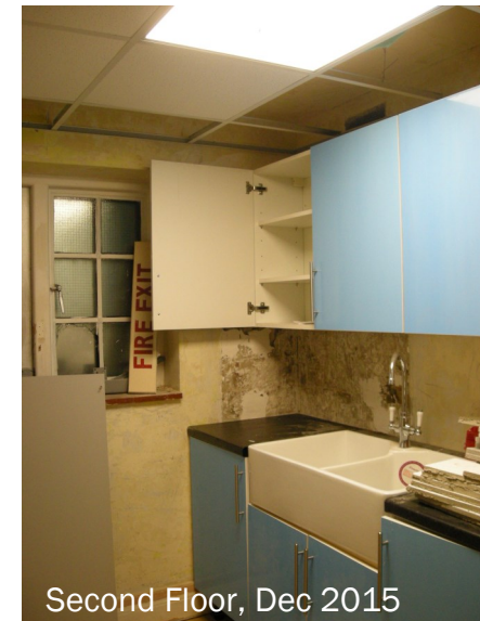
Second Floor, Dec 2015