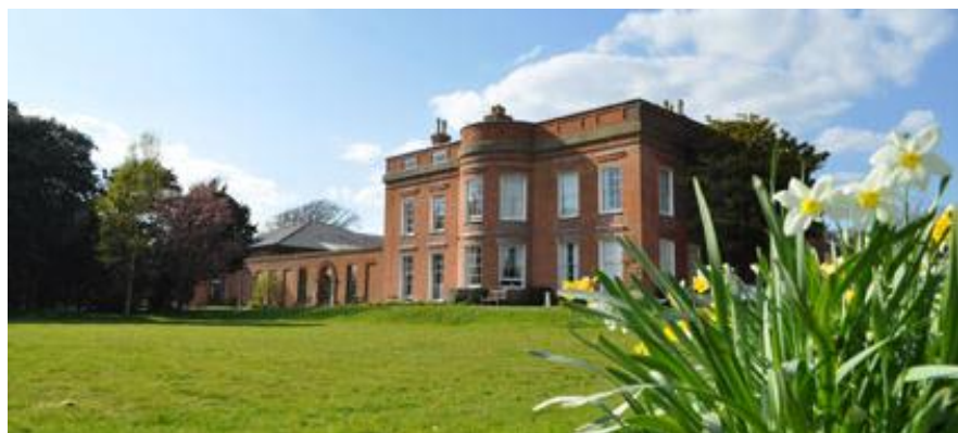
Figure 31: Southern facing elevation of Goring Hall