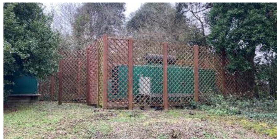
Figure 28: Plant within the grounds of Goring Hall