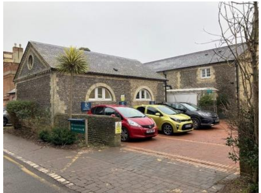
Figure 26: Examples of paving treatments in Goring Hall grounds.