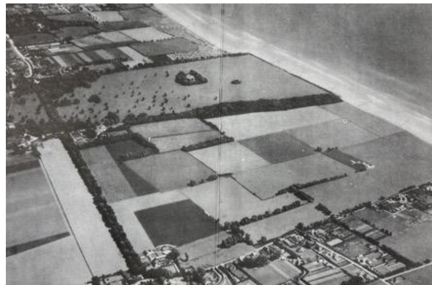
Figure 2: Aerial view of Goring Hall Estate prior to 1934 development.

the west, from the sea to Littlehampton Road as well as land that is now Maybridge, integrating the Ilex Avenue, which they identified as an important local feature. Due to the outbreak of the Second World War in 1939, only a quarter of the estate was actually built out. This stopped at The Plantation and railway line, although some roads had been laid out in the “Goring Gap” to the west of The Plantation. A gift was later made by the company of Ilex Avenue and The Plantation for public recreation.