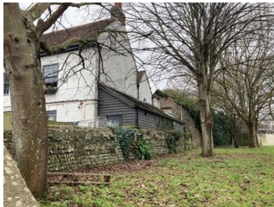
Figure 23: Examples of brick, flint and weatherboarding on and next to The Bull's Head.

which utilises random stone rubble for the external chimney breast and porch. Roofing materials are a mixture of clay and slate.