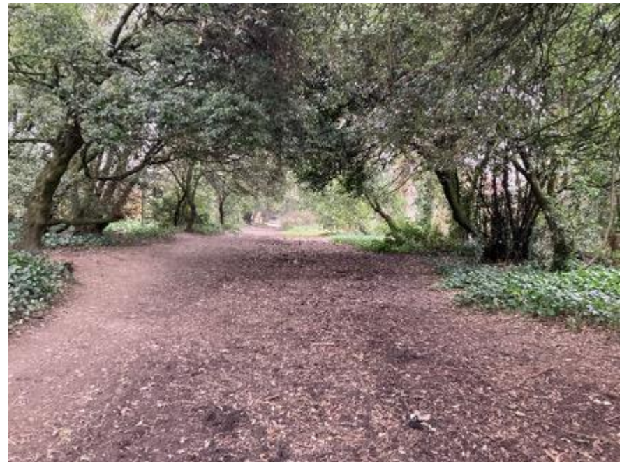
Figure 27: Dirt track along Ilex Avenue