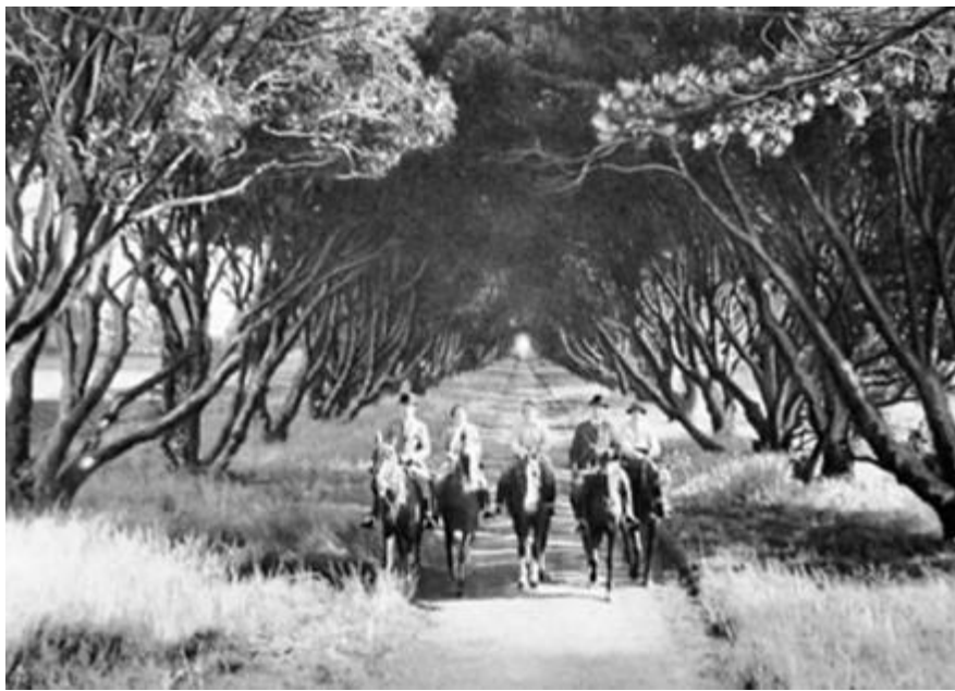
Figure 15: The Ilex Avenue, circa 1930