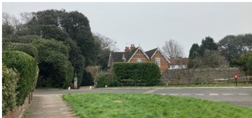
Figure 16: North Lodge and historic access to Goring Hall