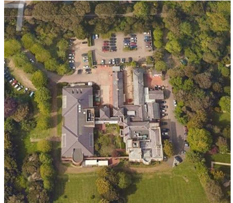
Fig 35: Google Image shows the extent of the development to Goring Hall to the west

development would be harmful to the significance of the conservation area as derived from its setting.