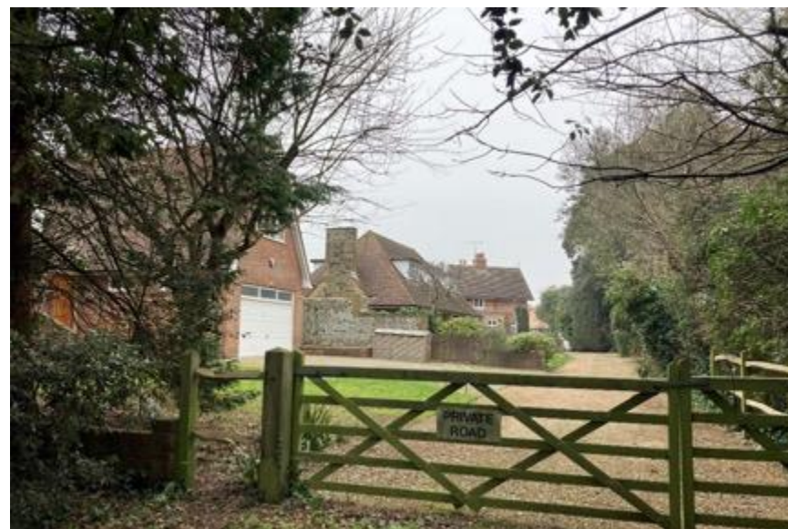
Figure 24: Modern housing within the conservation area