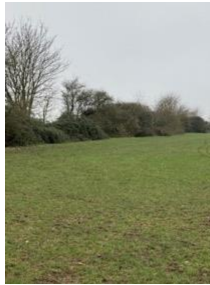
Fig 11: The Plantation (left) and the Playing Fields to the south of Goring Hall (right)