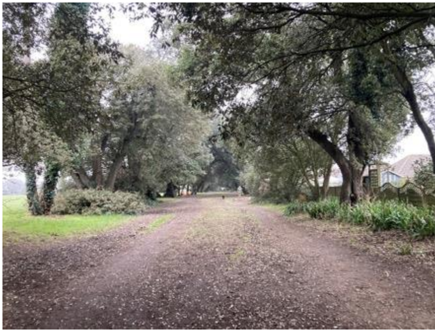
Figure 33: View westwards along Ilex Avenue