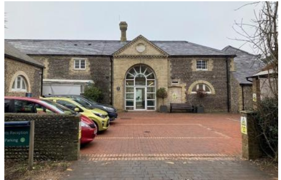
Figure 13: Former Stable building to Goring Hall (listed grade II)