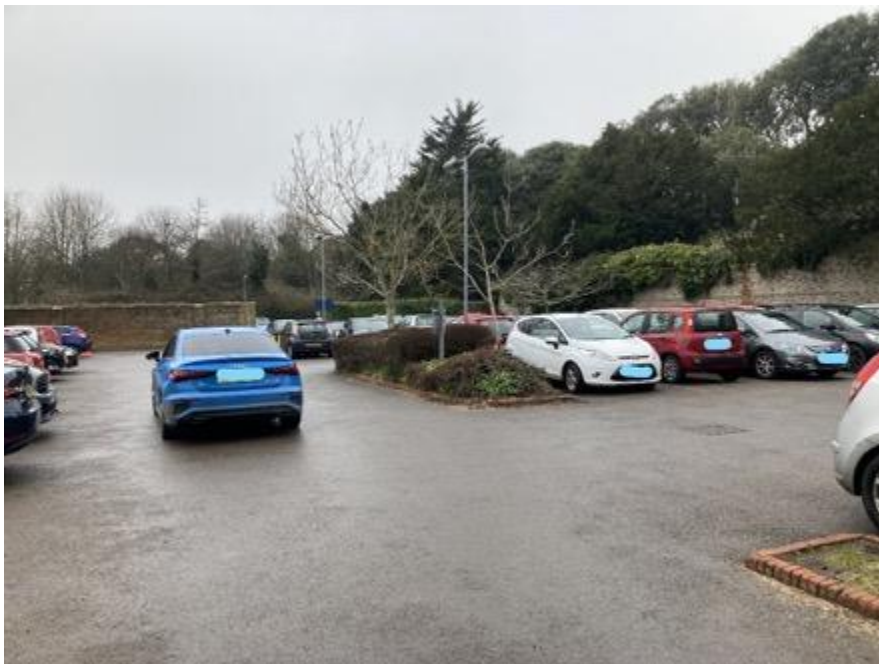
Figure 30: Carpark within the former orchard of Goring Hall