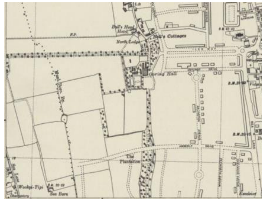
Figure 10: Sussex Sheet LXIV.SW Revised: 1938, Published: ca. 1948