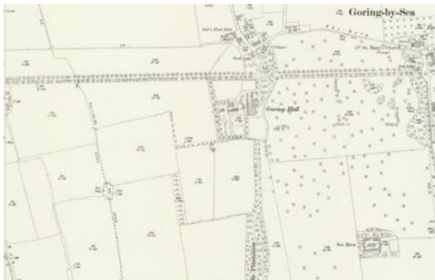
Figure 8: Sussex LXIV.13 Revised: 1909, Published: 1911