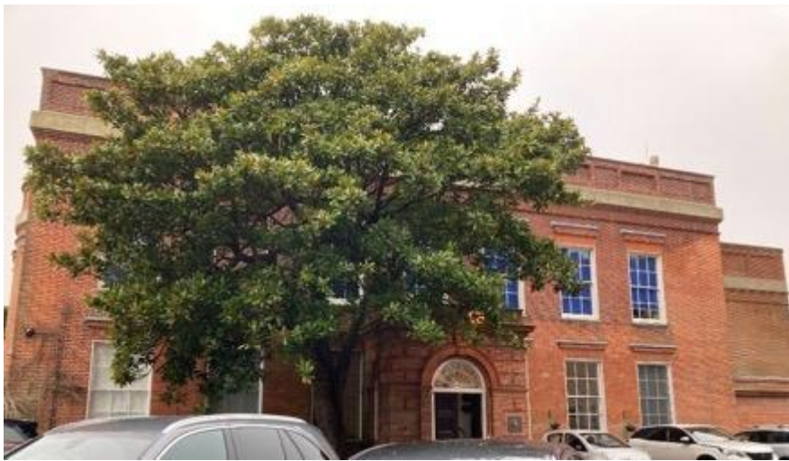
Figure 25: Brick used at Goring Hall