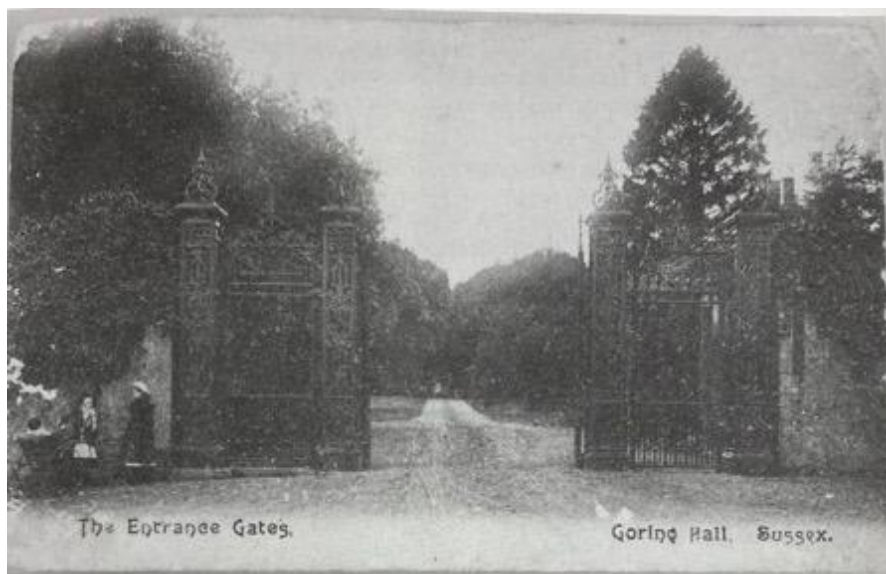
Figure 1: Eastern entrance Gates to Goring Hall Estate n.d. (pp 61)