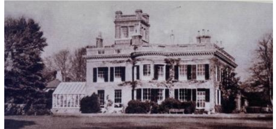
Figure 19: An early photograph of Goring Hall prior to its reconstruction in 1888

built in the Queen Anne style, in contrast to the more neo-classical appearance of the original building which was rendered. It has been altered and extended in the 20 th century, but retains a sense of the original building. Although not the oldest building within the conservation area (The Bull's Head has 16 th century elements behind an 18 th century façade), it is the grandest. The building is set within substantial grounds and the remaining service buildings in flint and yellow brick also contribute to the architectural interest of the conservation area. The flint buildings in particular are characteristic of the vernacular tradition of the locale.