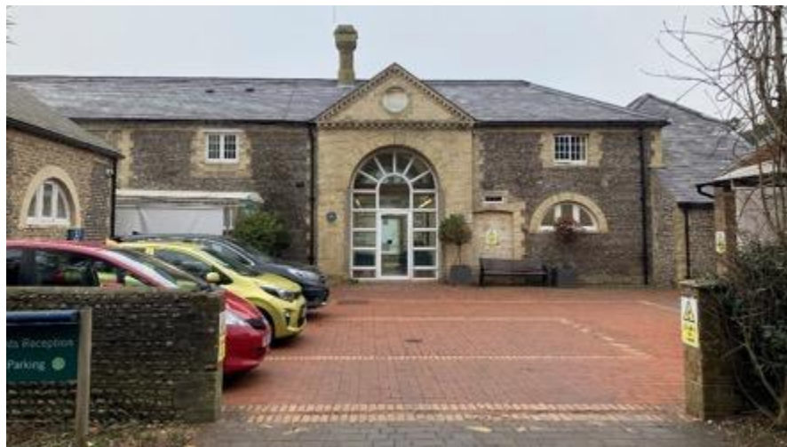
Figure 21: Former stable building at Goring Hall