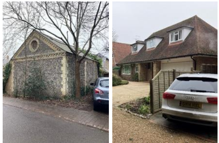
Figure 22: Historic flint outbuilding at Goring Hall (left) and modern housing to the north of Goring Hall grounds (right)