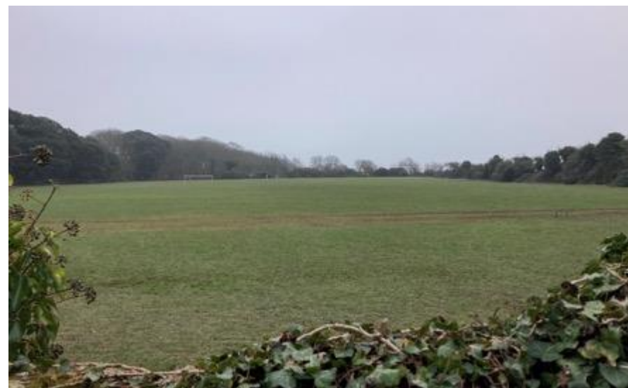
Figure 32: View from the raised promenade at Goring Hall to the south