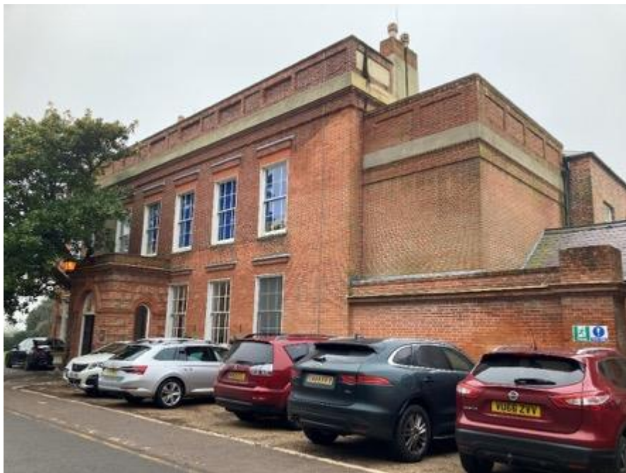
Figure 20: East facing elevation of Goring Hall with parking to front