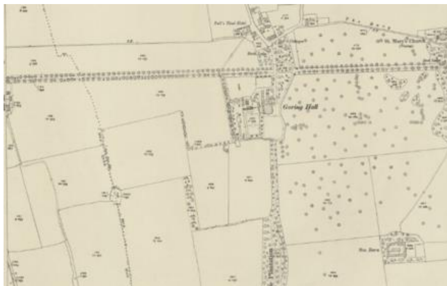
Figure 9: Sussex LXIV.13 Revised: 1932, Published: 1934