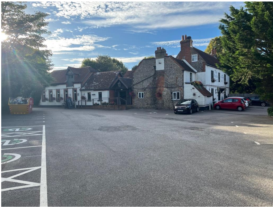
Figure 36: Hardstanding at the Bull's Head