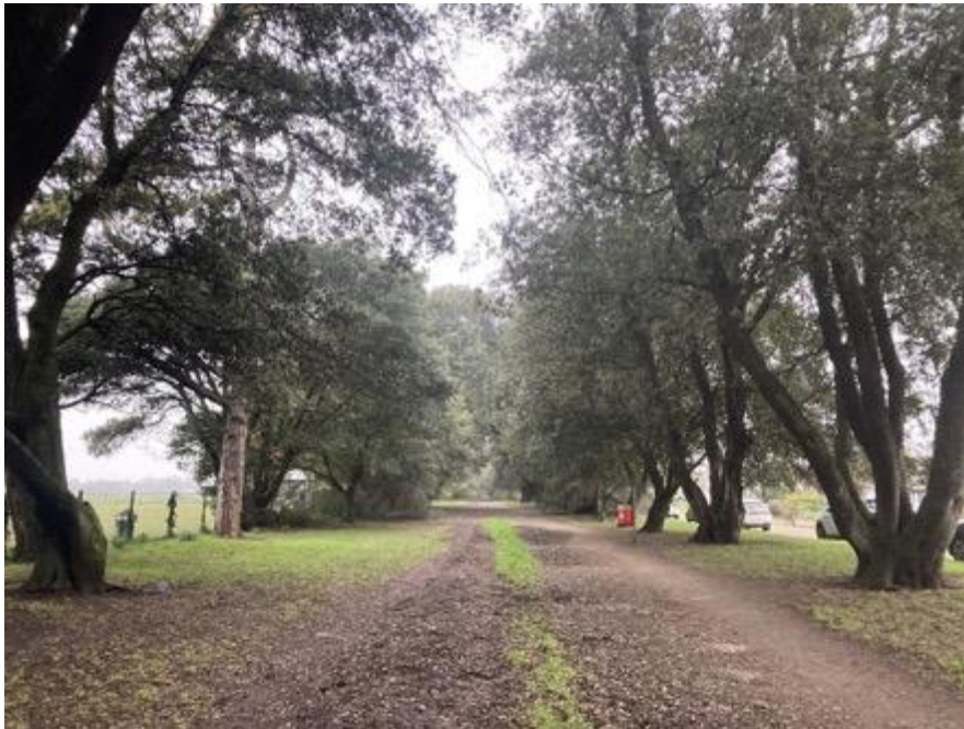
Figure 12: Ilex Avenue facing west