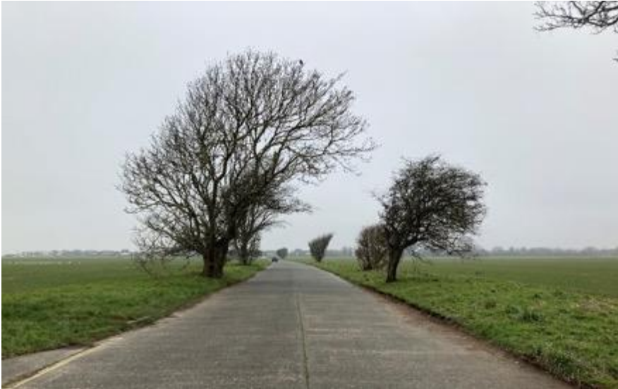
Figure 18: View facing westwards across the Goring-Ferring gap showing the roads laid out for the development of the Goring Hall estate.