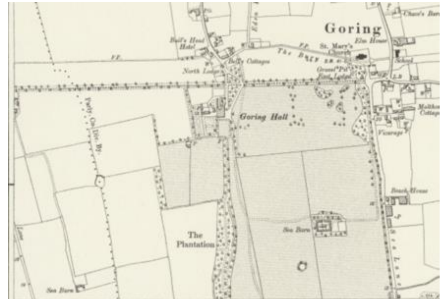
Figure 7: Sussex Sheet LXIV.SW Revised: 1896, Published: 1899