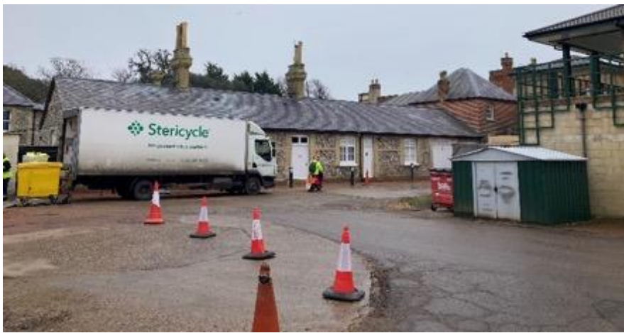
Figure 29: Extensive areas of hardstanding within the grounds of Goring Hall