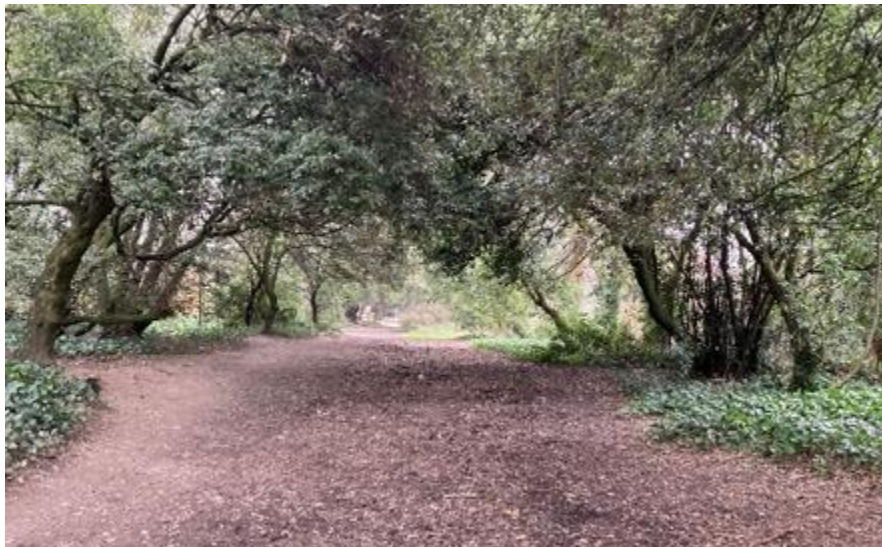
Figure 34: Views Eastwards along Ilex Avenue towards Sea Lane, Goring