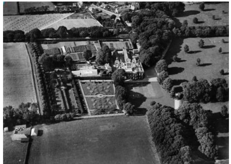
Figure 14: Goring Hall Estate, 1924; Source: Britain from Above