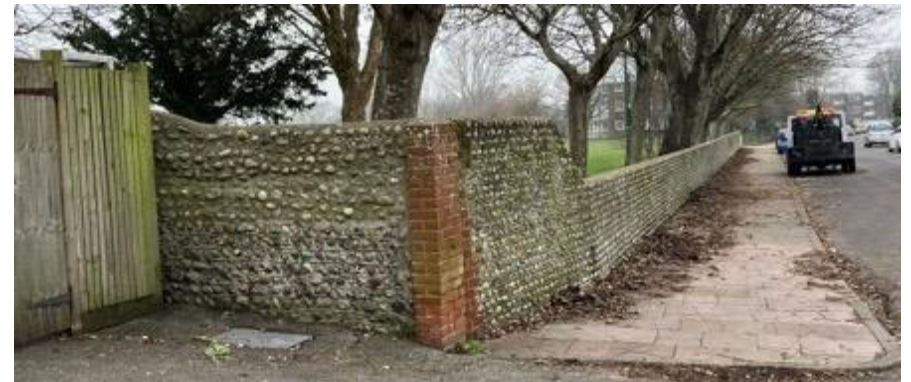
Figure 17: Flint wall to the north of The Bull's Head within the conservation area.