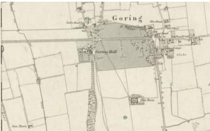
Figure 6: Sussex Sheet LXIV 1875 pub 1879