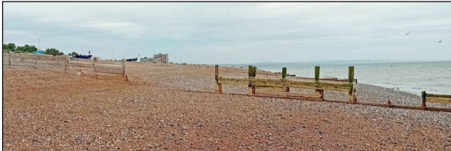
Photo of a groyne before works

The existing piles have snapped and the missing planks cannot be replaced. This has resulted in the shingle passing through the groyne and allowing the shingle beach and defence to erode.