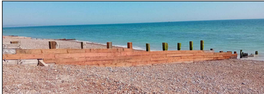
Photo of the same groyne immediately after the works were completed

The snapped piles have been extended/strengthened and the missing planks have been replaced. The shingle will naturally build up against the groyne.