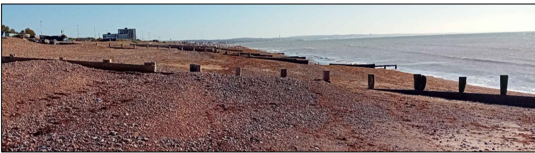
Photo of the same groyne two months after the works were completed

The shingle has naturally built up against the timber groyne. In the space of only two months the sea defence is back to its original condition.