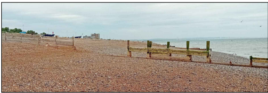
Photo of a groyne before works

The existing piles have snapped and the missing planks cannot be replaced. This has resulted in the shingle passing through the groyne and allowing the shingle beach and defence to erode.