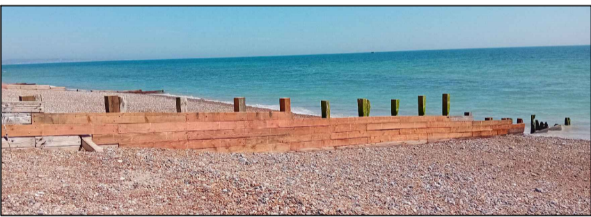
Photo of the same groyne immediately after the works were completed

The snapped piles have been extended/strengthened and the missing planks have been replaced. The shingle will naturally build up against the groyne.