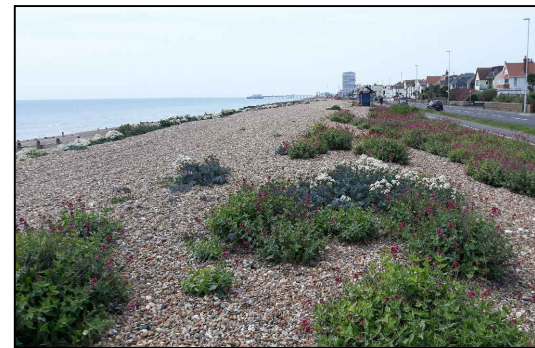
Red Valerian ( Centranthus ruber ) comes in both pink and white varieties. Red Valerian is an invasive species and takes over areas of the beach and stifles the growth of other plants.