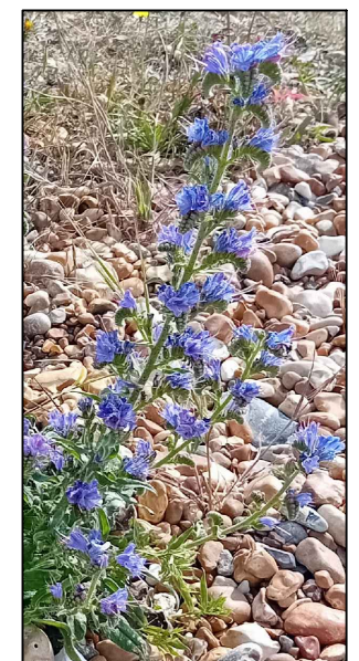
Viper's Bugloss ( Echium vulgare )