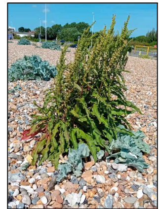
Curled Dock ( Rumex crispus )