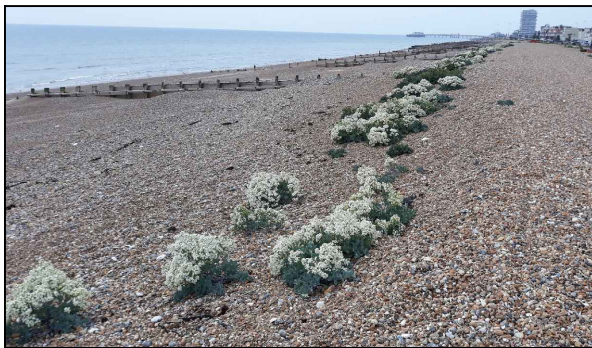
Sea Kale ( Crambe maritima ) which has large waxy leaves and in the spring/summer has a mass of white creamy flowers. Sea Kale is classed as pioneer community and found on stable sections of beaches.

To allow these works to be undertaken, some of the vegetated shingle plants which have established themselves by the groynes will be temporarily removed. Upon completion of the works the plants will be replaced. They will then be monitored to ensure they have settled into the new location. If they do not survive the area will be seeded to allow new plants to grow.