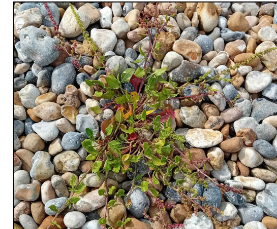
Sea-beet ( Beta vulgaris )