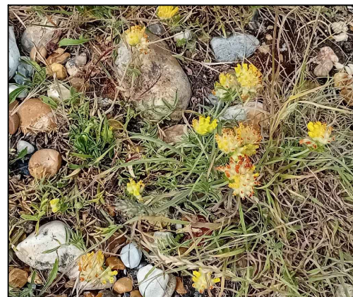
Kidney Vetch ( Anthyllis Vulneraria )

Proposed species of plants to be sourced: