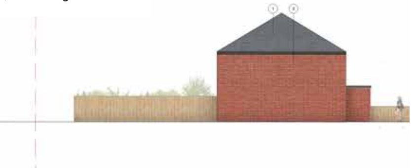
Side, West facing elevations