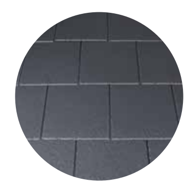
Grey roof tiles