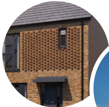
Brick Detailing & Slate Roofed