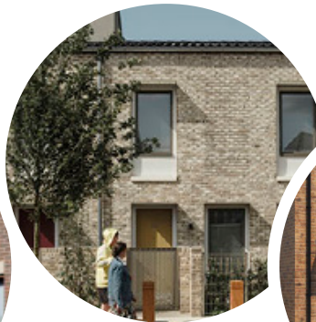
Entrances, Red brick