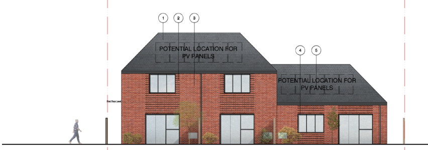
East Block rear elevations