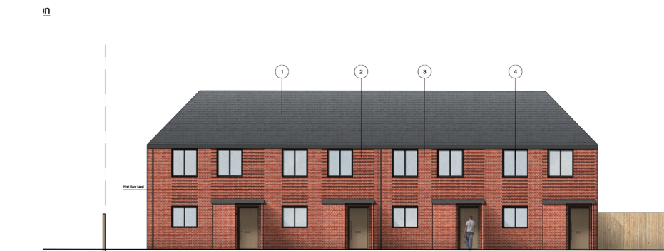
West Block Front elevations