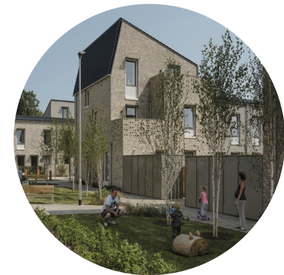
Examples of landscapes