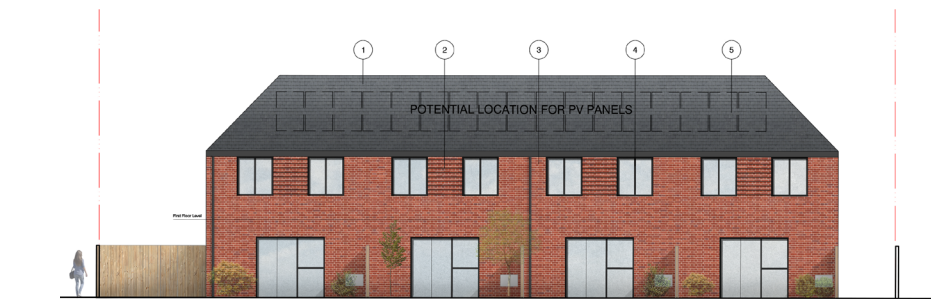
West Block rear elevations