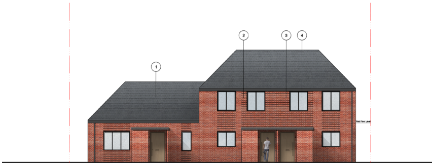
East Block Front elevations