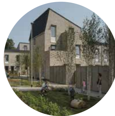
Examples of landscapes