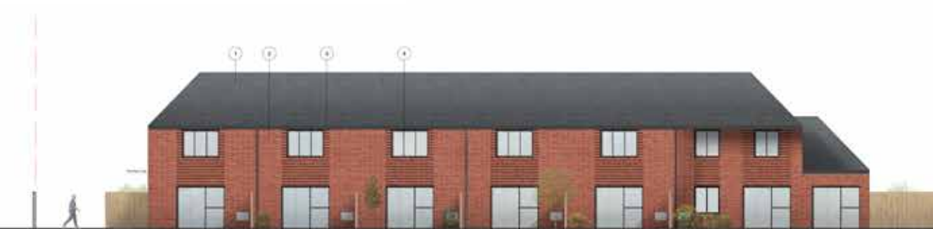
South Block rear elevations