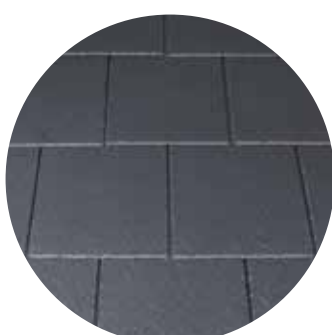
Grey roof tile