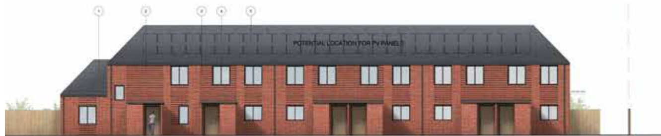
South Block rear elevations