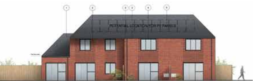
North Block front elevations