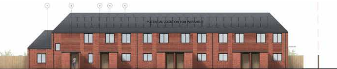
South Block rear elevations