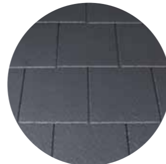
Grey roof tile