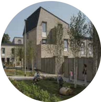
Examples of landscapes