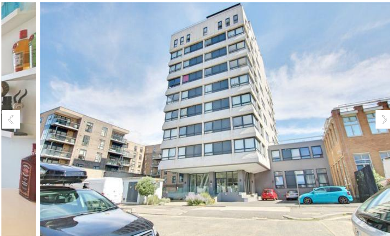
📷 10 images