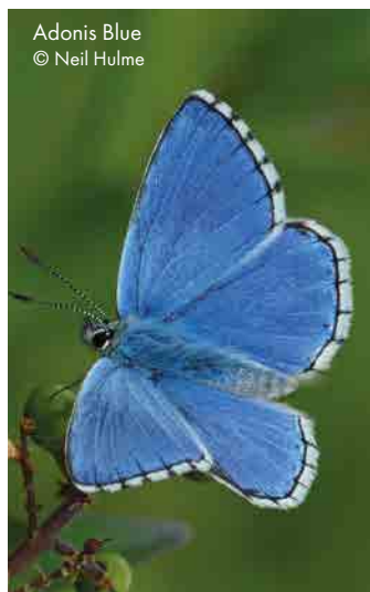
Adonis Blue © Neil Hulme