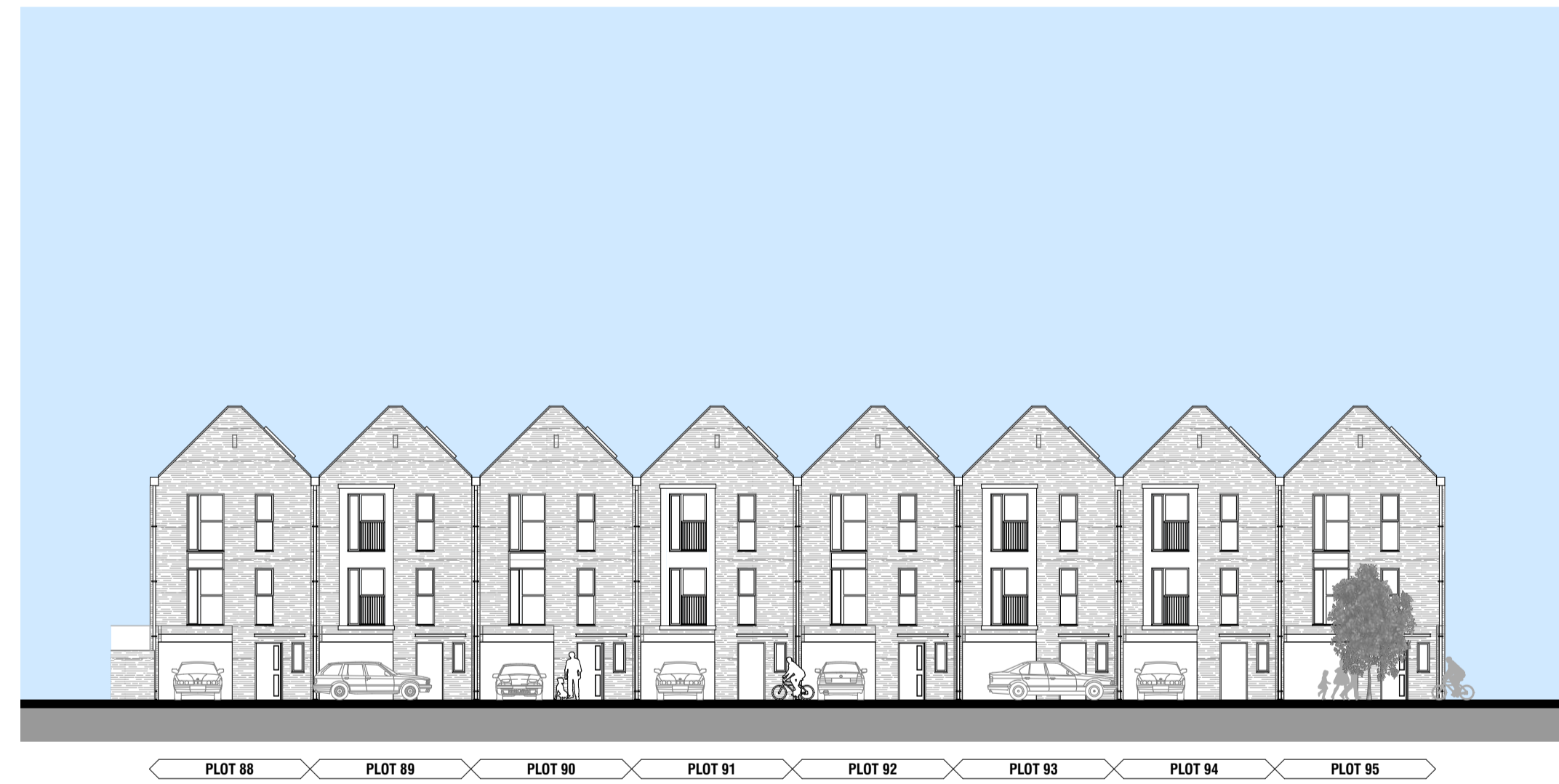
Proposed Street Scene 8