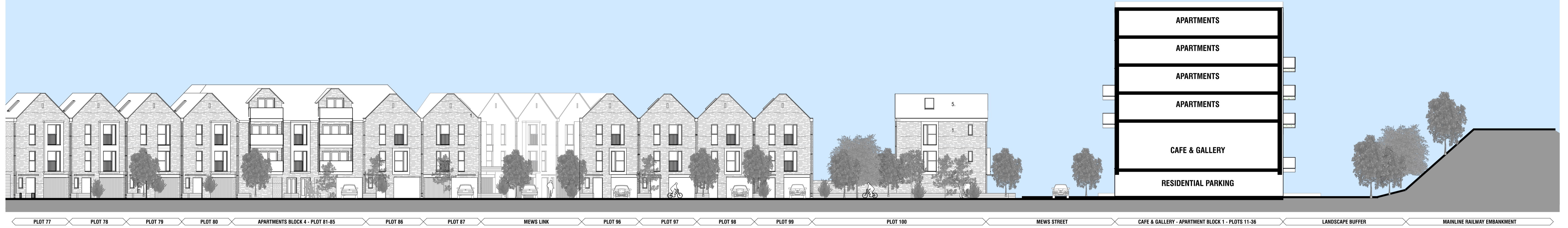
Proposed Street Scene 7