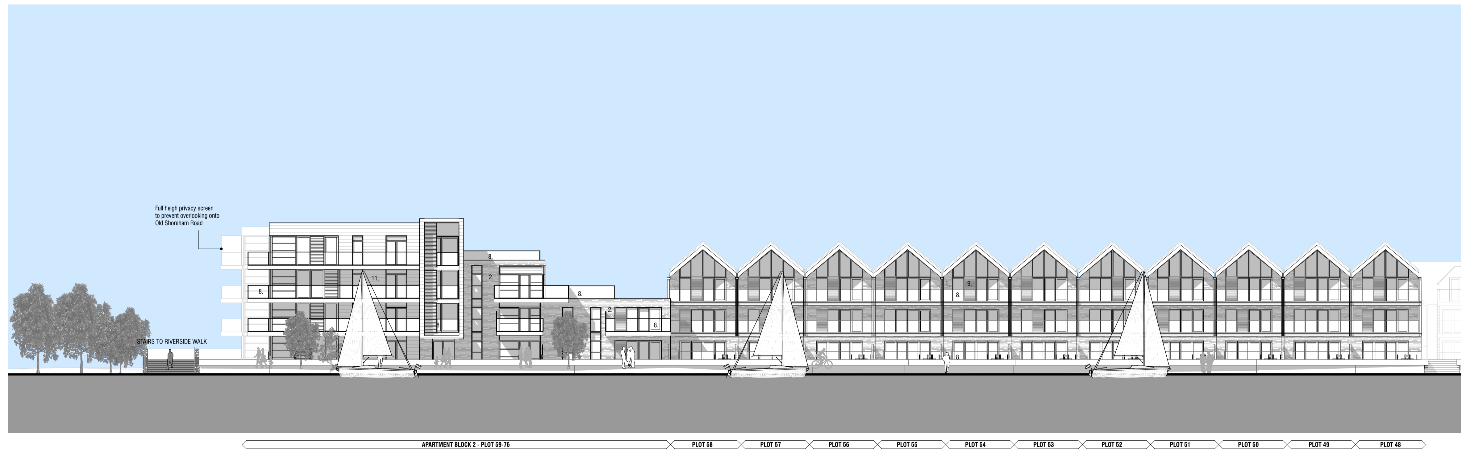
Proposed Street Scene 6