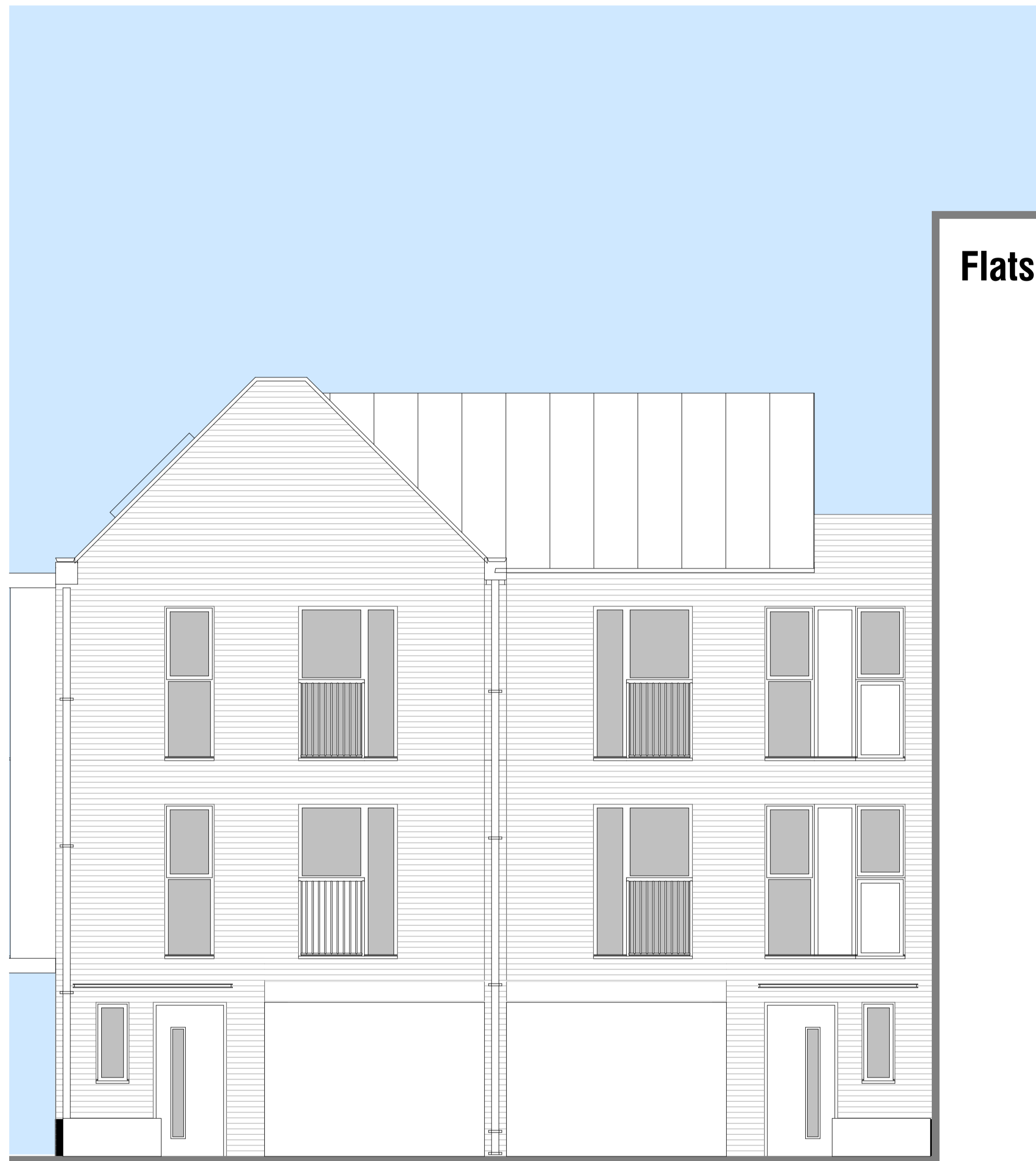
Plot 107 (Type 5)