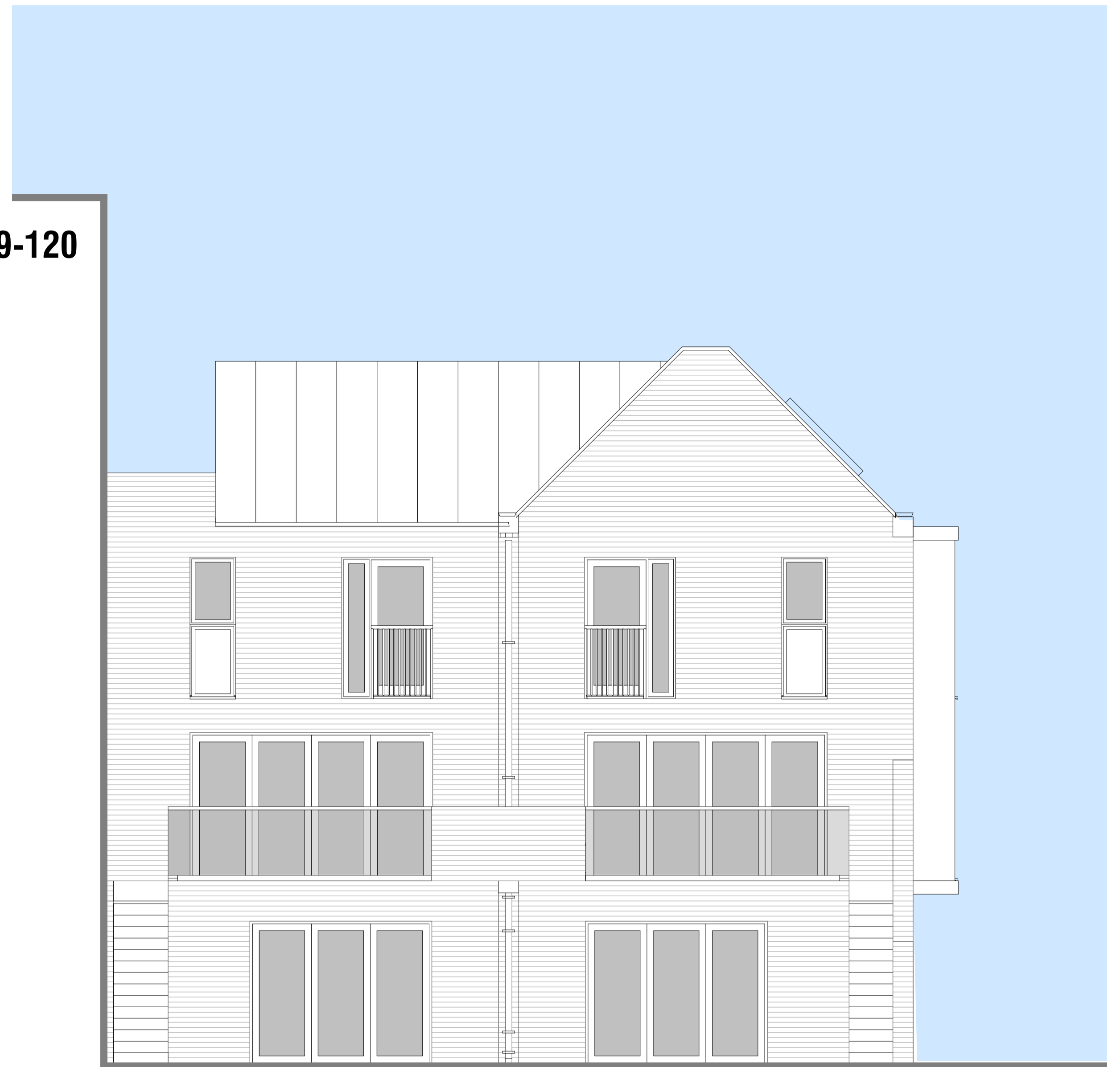
Type 6 Plot 108 Rear Elevation