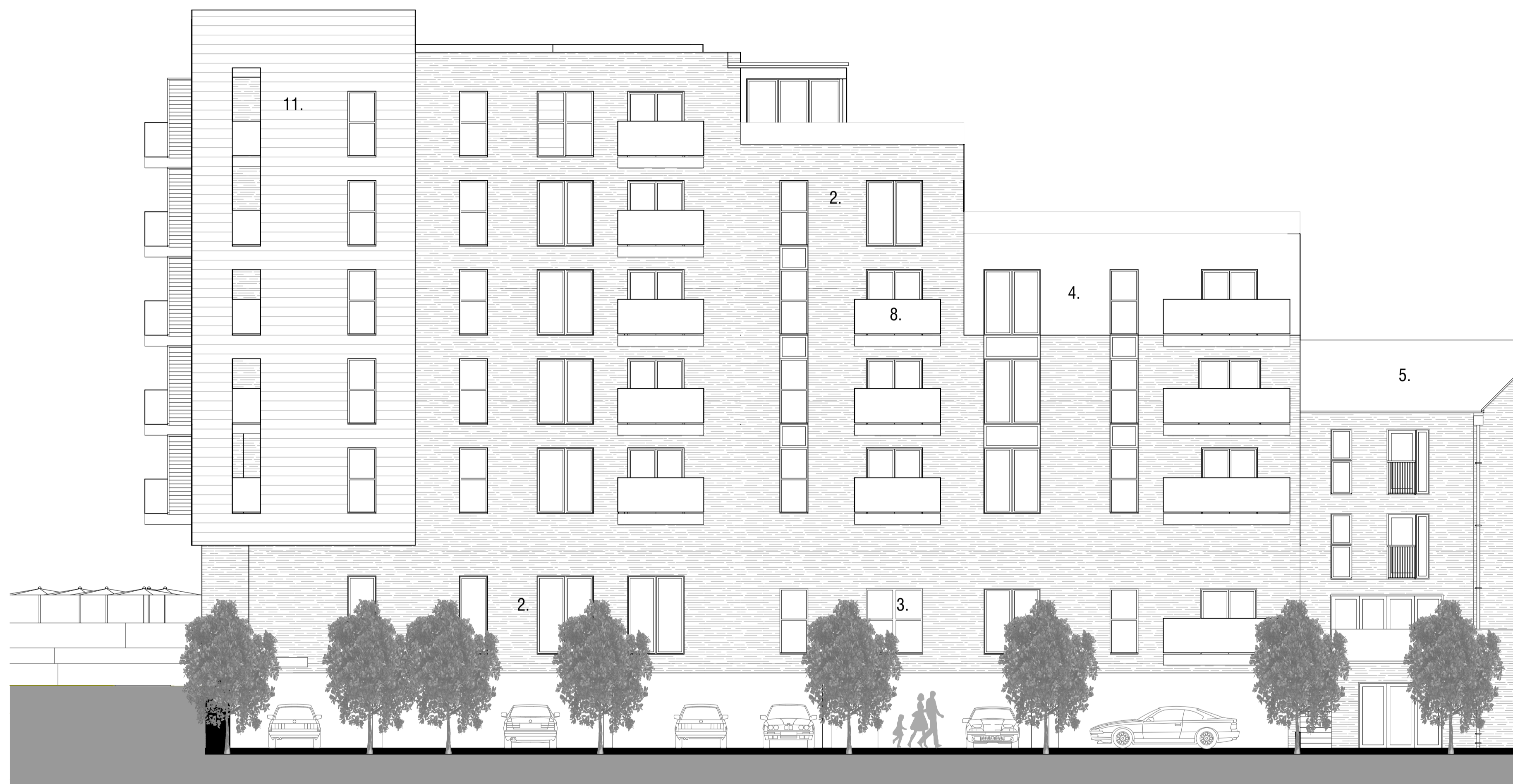
Block 1 Railway Elevation