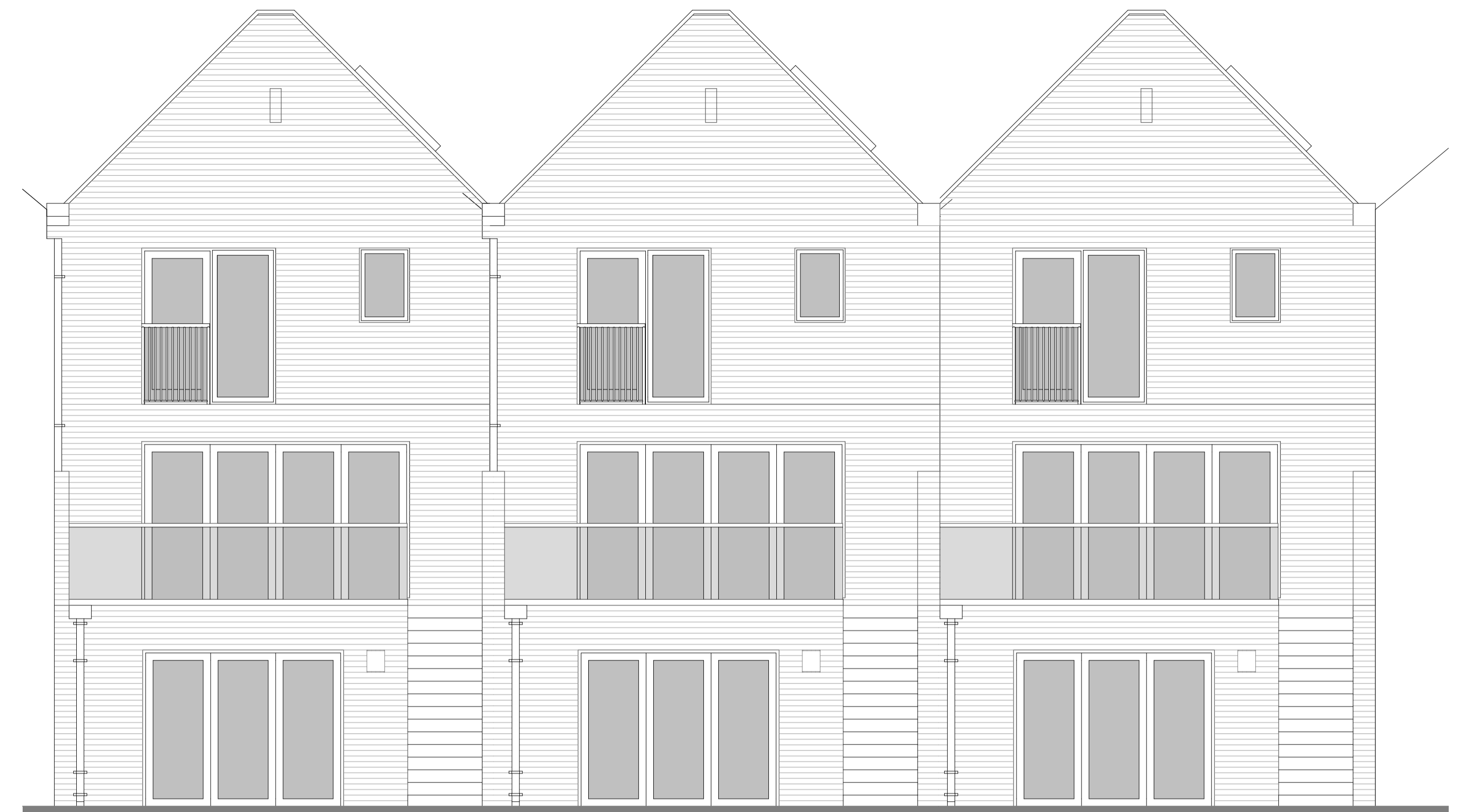
Type 1 Rear Elevation