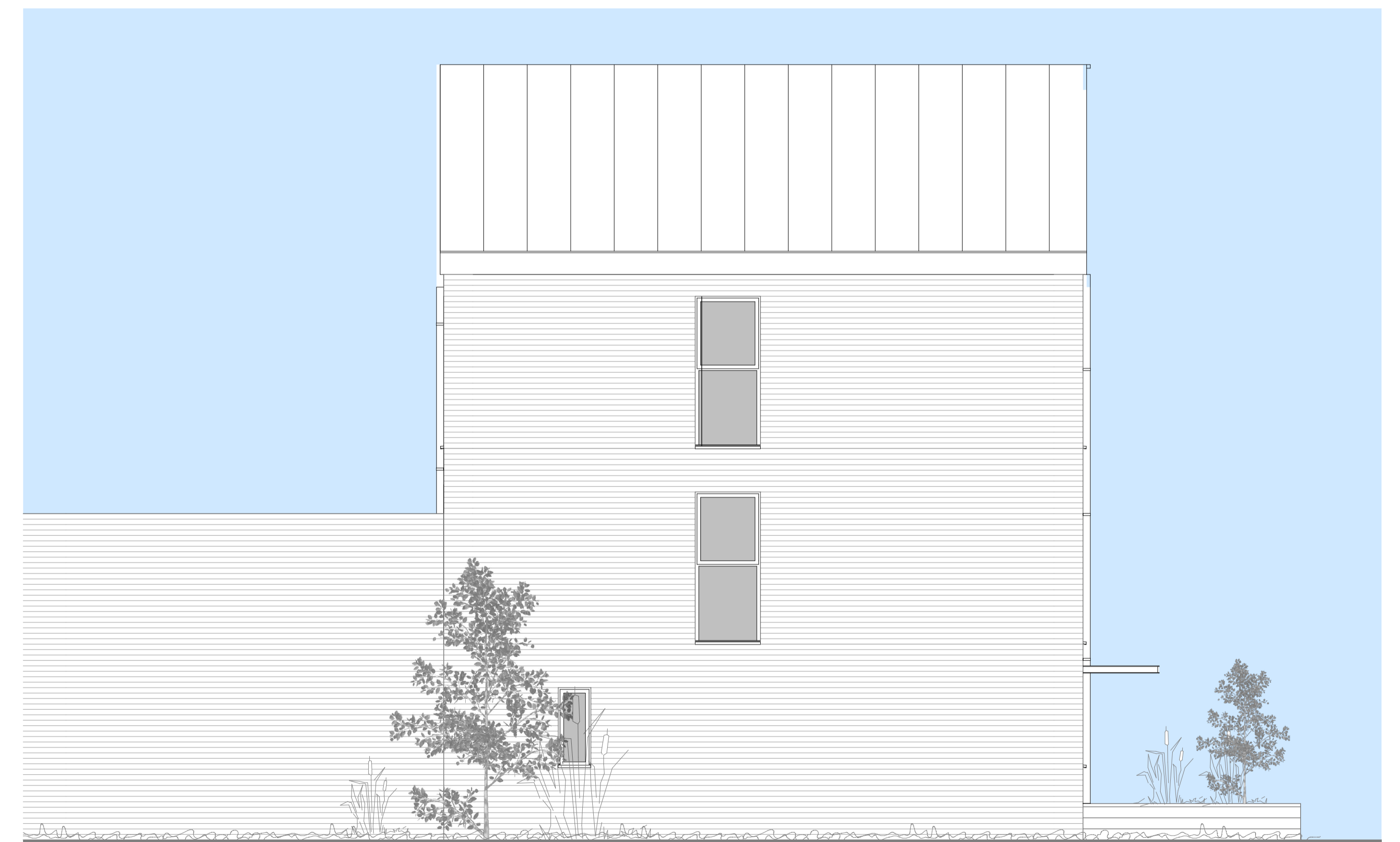
Type 1 End of terrace elevation (plot 1)