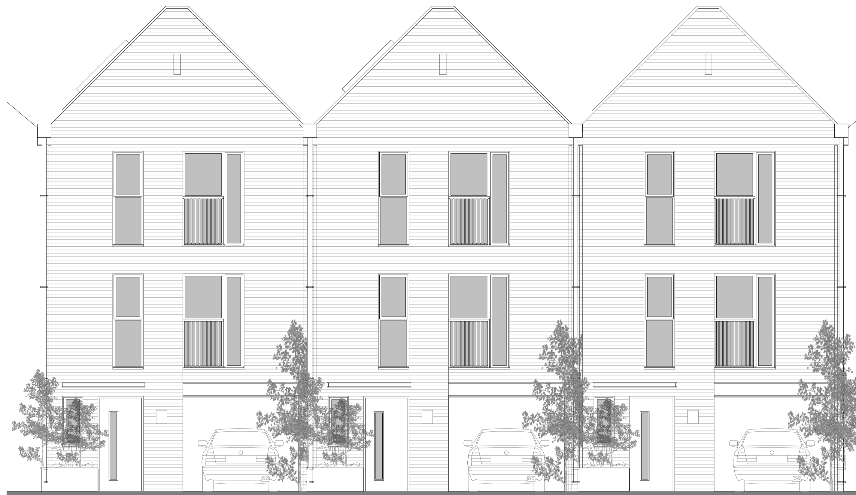
Type 1 Front Elevation