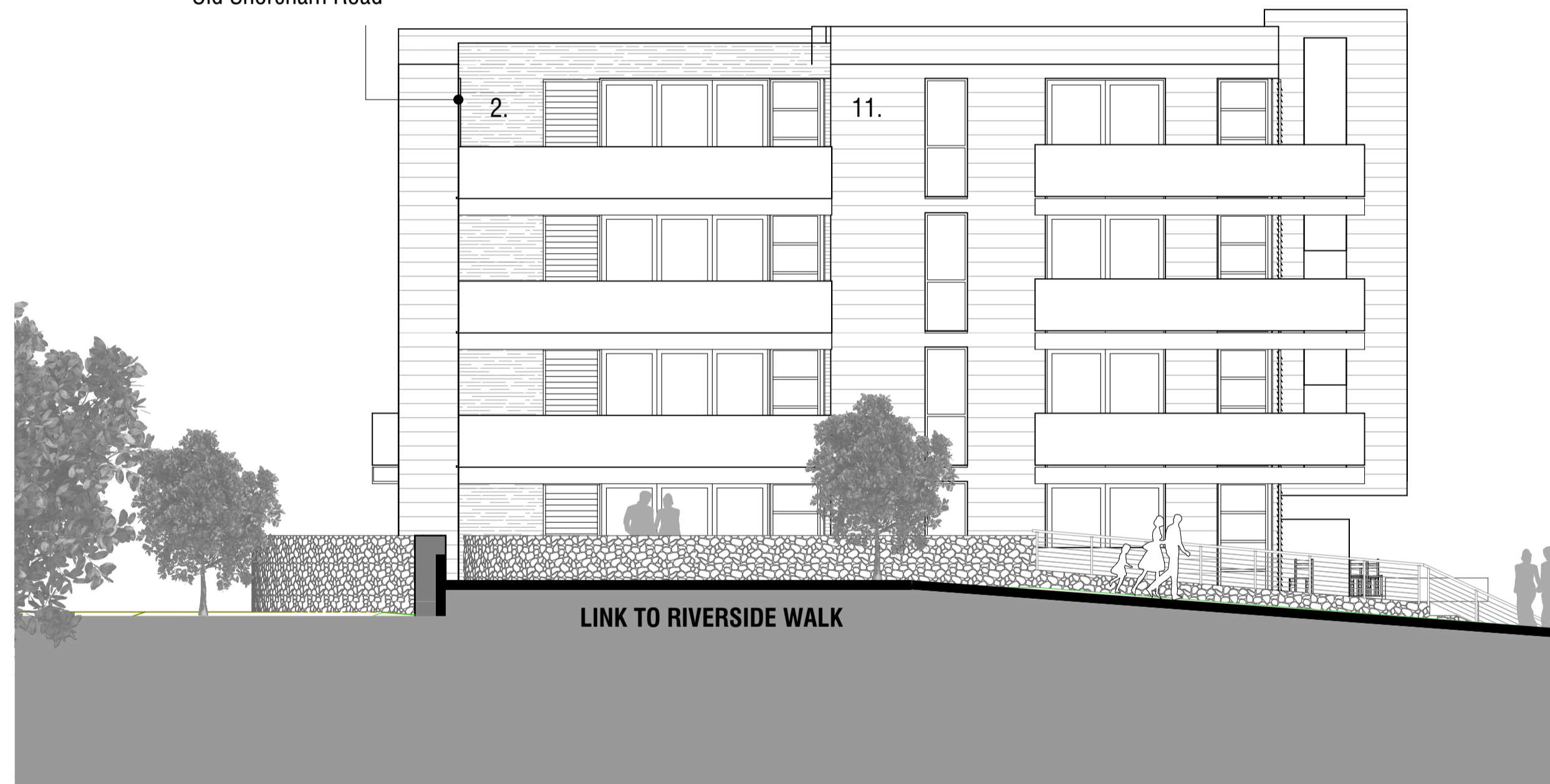
Block 2 End Elevation

Full height privacy screen to prevent overlooking onto Old Shoreham Road