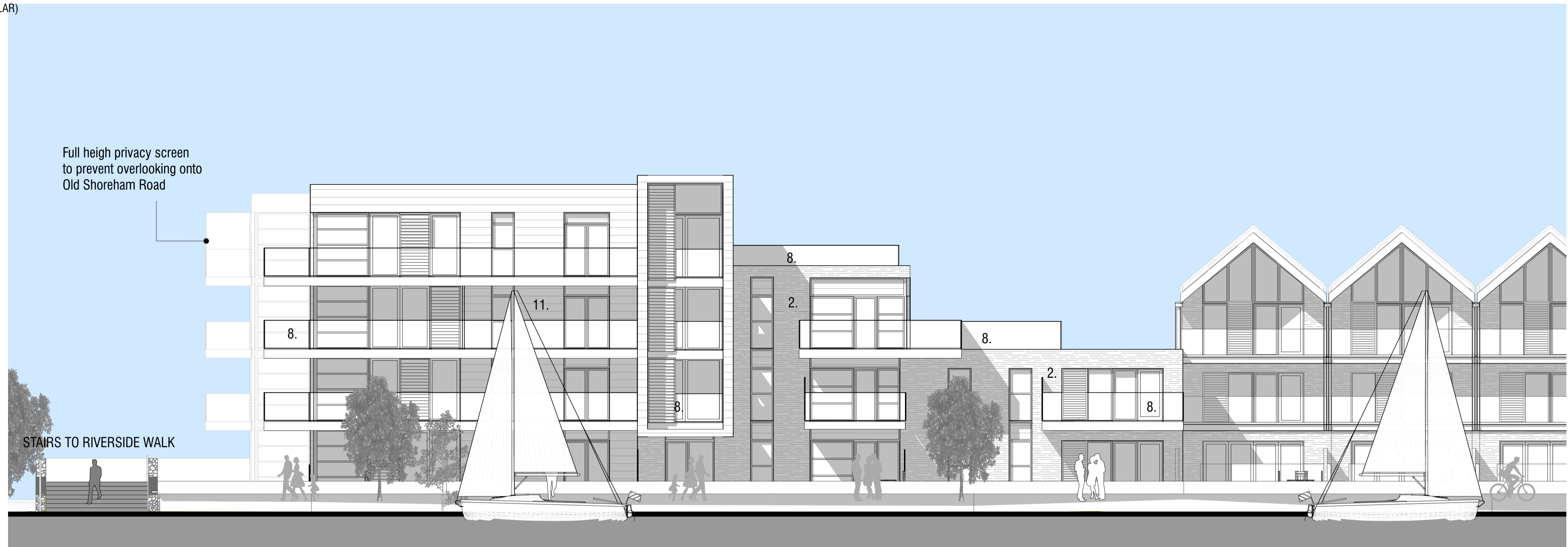
Block 2 Waterfront Elevation