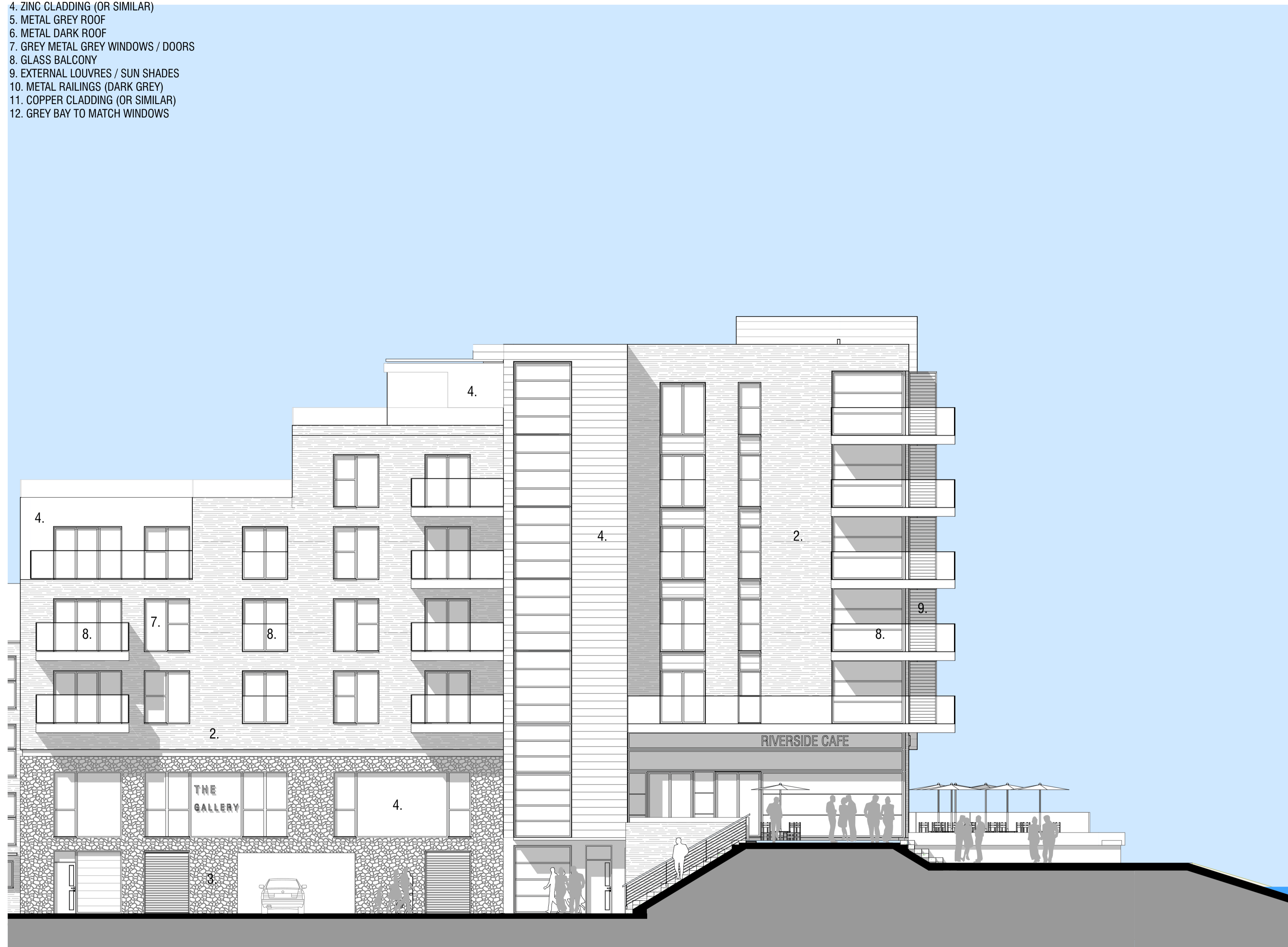
Block 1 Internal Elevation